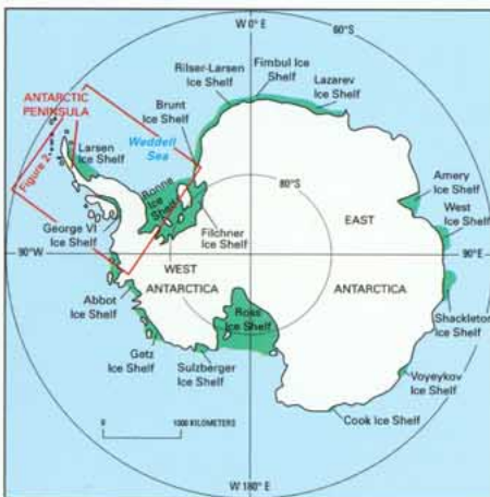
Figure 1. Location of the Antarctic Peninsula and principal ice shelves of Antarctica, areas of dynamic coastal change.

RADARSAT images of Antarctica created by the Byrd Polar Research Center of Ohio State University. All digital cartographic data for I-2600-A-C will be available in the web-accessible USGS Atlas of Antarctic Research, and new coastline information will be incorporated into the Scientific Committee on Antarctic Research Antarctic Digital Database (ADD) (see http://www.nerc-bas.ac.uk/public/magic/add_home.html ). The ADD is a multinational project to maintain a digital cartographic database of Antarctica.