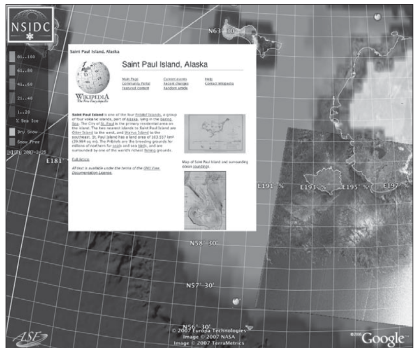
Figure 1: Screenshot showing a combination of satellite-derived data from the National Snow and Ice Data Center (NSIDC, www.nsidc.org ) indicating the extent of the sea-ice cover in the southern Bering Sea (light gray shades) in late March 2007, along with a RADARSAT Synthetic Aperture Radar scene provided by ASF. Google™ Earth also integrates high-resolution, visible range satellite imagery showing the land surface. Also, thanks to an effort led by M. Nolan at UA ( www.earthslot.org/ipy ), a large number of data layers showing additional information of relevance for the IPY are included. Shown as well, is a window inset that appears when clicking on St. Paul Island, explaining more about the island and showing historical maps. The information for this inset has been derived from Wikipedia ( en.wikipedia.org ), a collaborative, on-line encyclopedia project that is reflective of the vast potential for multilateral exchange and collaboration in the digital age.